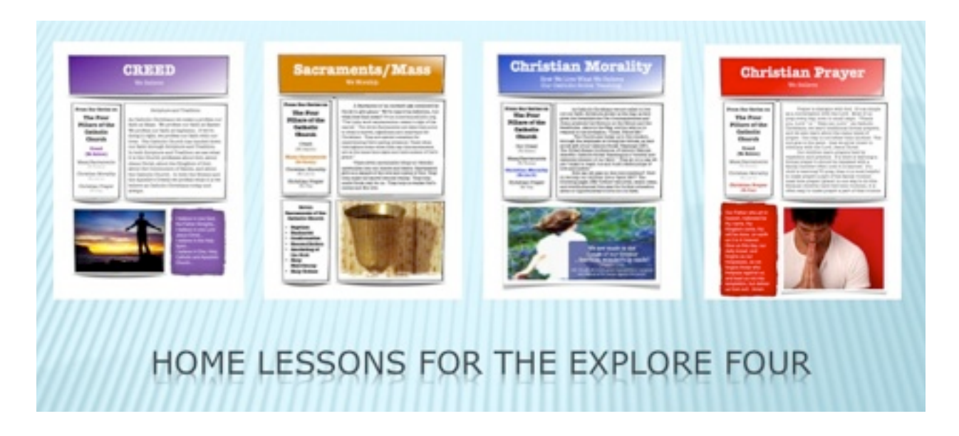
The Catholic Faith - Learn it! Love it! Live it!

You can find more information online at <u>www.stjudes.org</u> on the Faith Formation Explore Four Page, or the Event Registration page, or in Newsletters available on the Faith Formation home page. You can also call the Director of Faith Formation with any questions you might have. 815-463-4283.